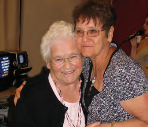
Dancing at a monthly party.