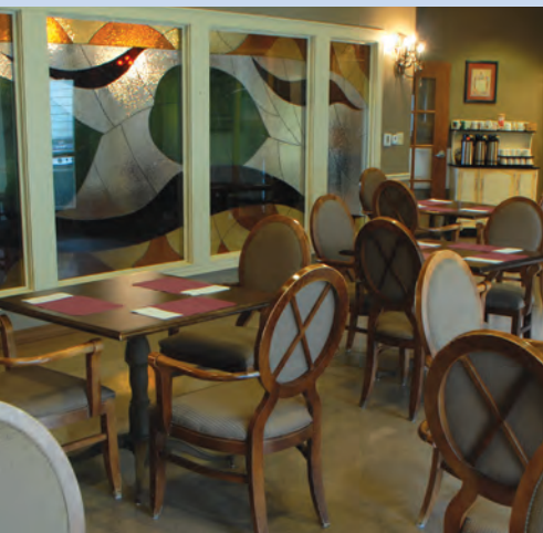
Dining Room at CrossWinds.