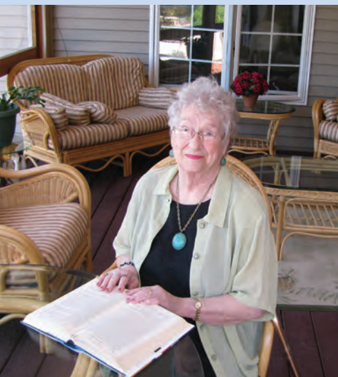
Reading in the sunroom at Ridgewood Estates.